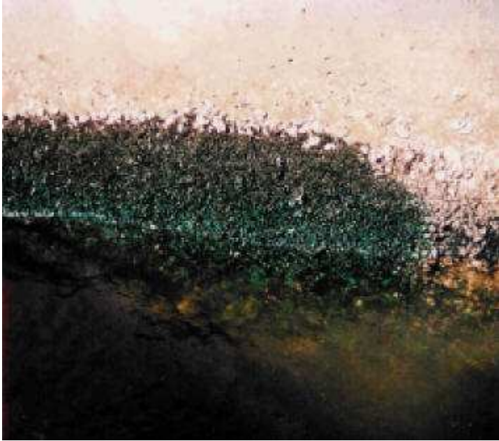
U.S. Geological Survey

Green mussels are bivalve mussels native to the Asia-Pacific region where they are widely distributed. Green mussels generally inhabit intertidal, subtidal and estuarine environments with high salinity. They attach to hard substances, but are capable of relocating. Dense colonies can develop in optimal temperature and salinity conditions, sometimes with thousands of individuals per square meter. The introduction of green mussels into Australia, Japan, the Caribbean, North America, and South America was caused by fouling on boat hulls or ballast-water discharge. Because of its dispersed spawning nature, lack of local predators, fast growth, and high tolerance of environmental conditions, the green mussel population is expected to expand in Atlantic habitats until it reaches its ecologic limits (ISSG 2008). The green mussel was first introduced to the U.S. in Tampa Bay in 1999, where it resulted in significant ecological and environmental damage (Power et al. 2008). There are concerns that the species will establish populations at Gray's Reef National Marine Sanctuary, located off the Georgia coast (Power et al. 2004).