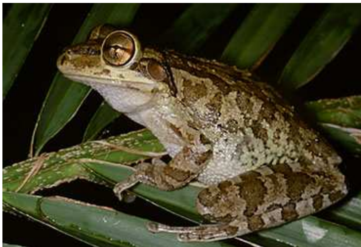
U.S. Geological Survey