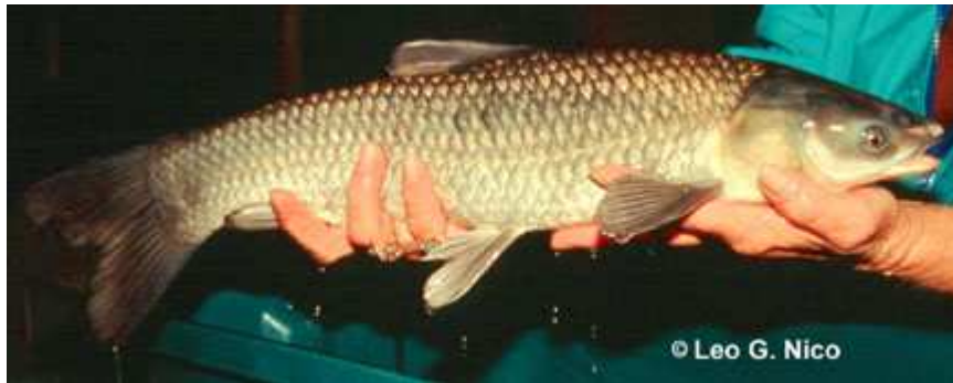
Leo Nico, USGS

The black carp is a bottom-dwelling molluscivore that has been used by U.S. fish farmers as a biological control for disease-carrying snails in their farm ponds. Black carp was first brought into the U.S. from Asia in the early 1970s as a "contaminant" in imported grass carp stocks. Subsequent introductions of black carp occurred in the early 1980s. During this period it was imported as a food fish and as a biological control agent to combat the spread of yellow grub ( Clinostomum marginatum ) in aquaculture ponds. The first known record of an introduction of black carp into open waters occurred in Missouri in 1994. The black carp has since been reported in Arkansas, Illinois, Mississippi, and Missouri (ISSG 2008). Black carp are considered to be a future threat to Georgia although there are no known populations present in the state. Current laws in Georgia prohibit the possession and importation of the species into the state. However, they have been documented in other southeastern states and have been shown to have significant ecological, economic, or health impacts where they occur.