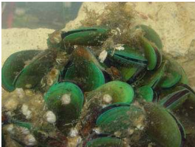
U.S. Geological Survey