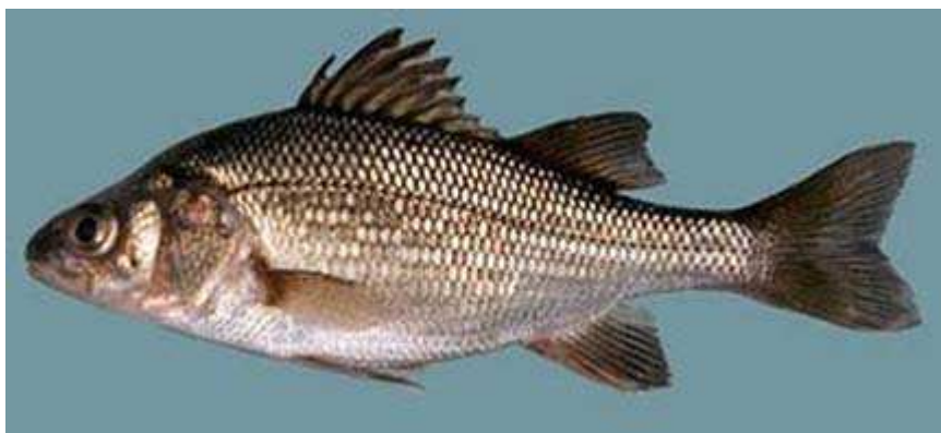
Douglas Facey, USGS

White perch is a semi-anadromous fish that in its native range migrates from the saltier areas of bays and coastland into tidal-fresh portions of streams and rivers to spawn in