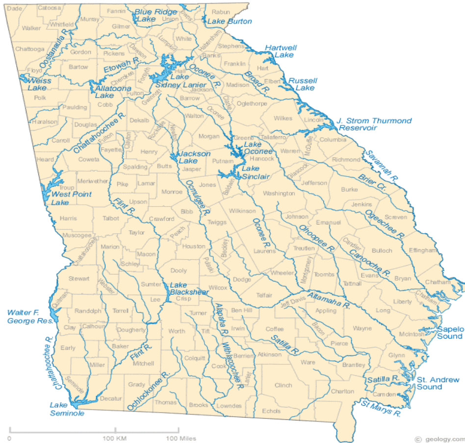
Figure 1. Georgia's Waterways: Along with its coastal waters, Georgia is home to 12,000 miles of streams and over 500,000 acres of reservoirs.

the Blue Ridge and Piedmont ecoregions while hydrilla, Japanese climbing ferns and the Asian clam threaten habitats and species in the Southeastern Plains. Finally, the Southern Coastal Plain is facing significant negative impacts caused by flathead catfish, water hyacinth, alligatorweed, parrotfeather, giant reed, and the channeled apple snail (GADNR 2005).